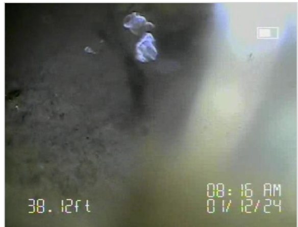
Limit of Reach - Sewer